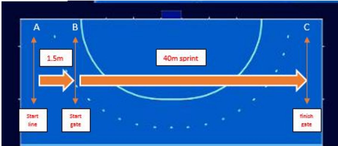
Figure 2 - The setup for the Repeated Sprint Ability Test